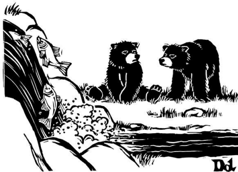
"The ambient nature sounds are making me too sleepy to hunt."

A wonderful example for us when we face struggle and difficulty; can we find the courage to use that time to change the world and learn to love, even our enemies?